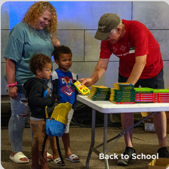
Back to School